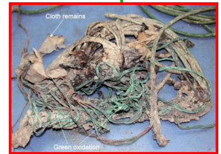
Christmas Extension Cord

It’s that time of year again. Time for exploding power strips, overheated extension cords, toy recalls, and burning trees inside the house. That’s right folks – it’s Christmas at DPI! Common claim issues for adjusters at this time of year will be: power strips/surge protectors, extension cords, and space heaters.